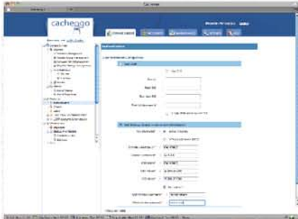
Cachengo Storage Manager